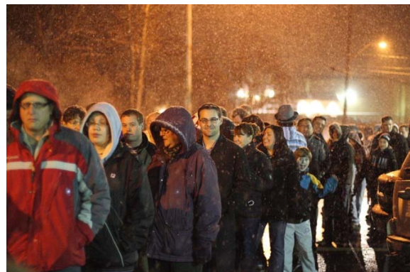
Nov. 14, 2009 - Over 700 spectators

The SIJHL regular season schedule is 52 regular season games. Most of the games are played on weekends with the exception of a few games during the week played against nearby teams. On the road, the Flyers use their own bus with professional driver. The Club covers accommodation and meal costs during team travel.